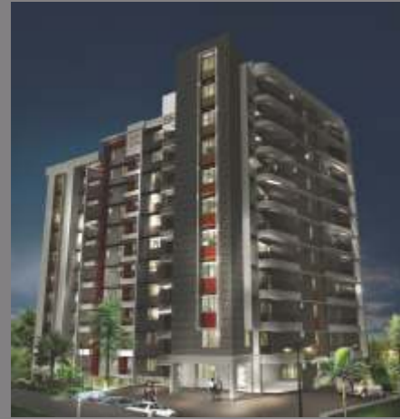
Tirur Heights, Luxury Apartments, Tirur