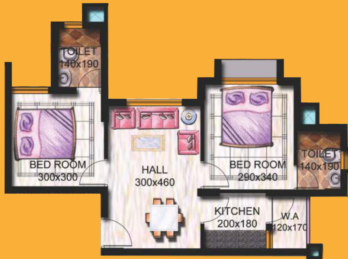
Type: F | 2BHK | Super built up area: 755 sq.ft.