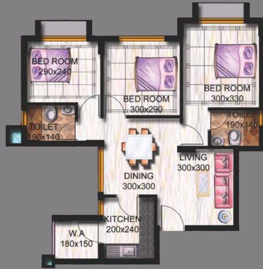
Type: A | 3BHK | Super built up area: 877 sq.ft.