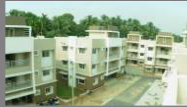
Thunchan Scapes, Smart Apartments, Tirur