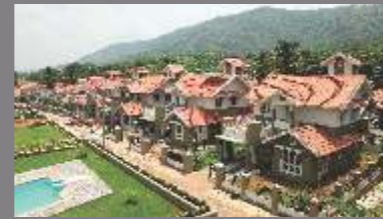
Misty Hills, Premium Villas, Perinthalmanna