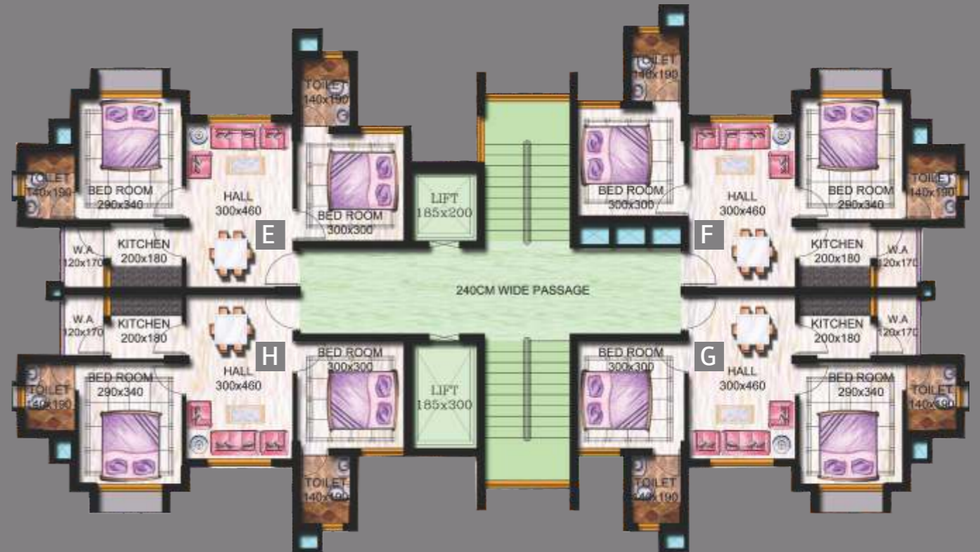
Block: 2 | 2BHK | Typical floor plan