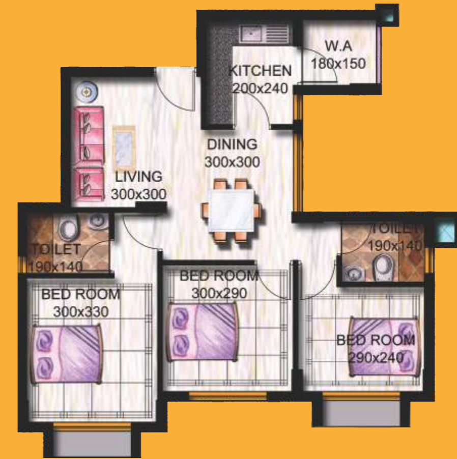
Type: C | 3BHK | Super built up area: 877 sq.ft.