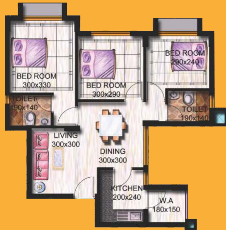
Type: B | 3BHK | Super built up area: 877 sq.ft.