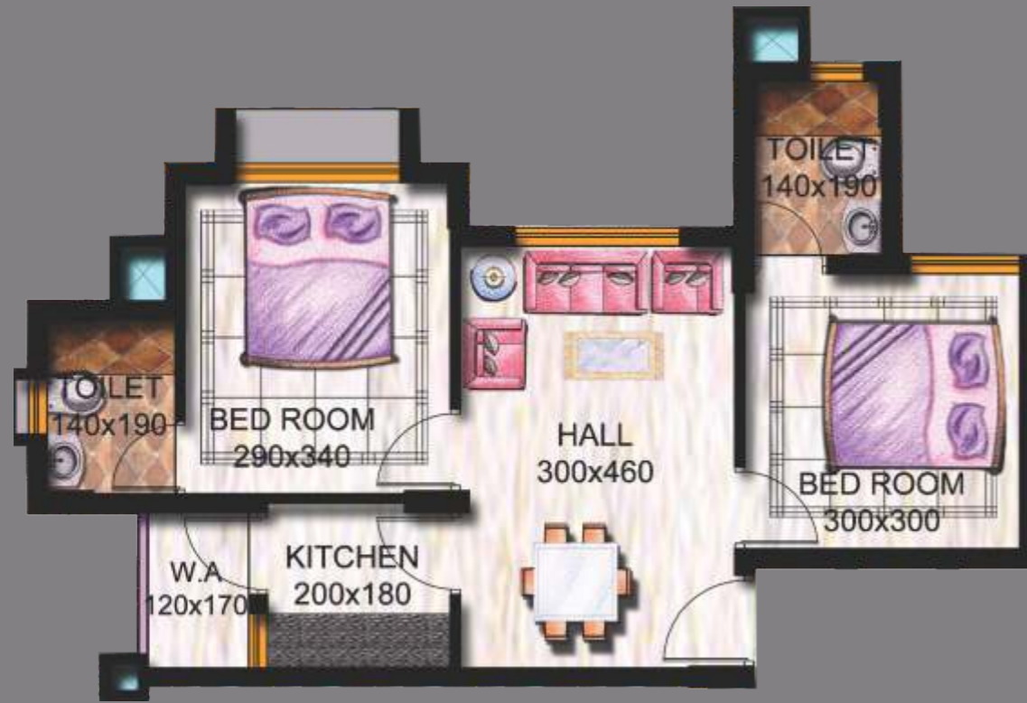
Type: E | 2BHK | Super built up area: 755 sq.ft.