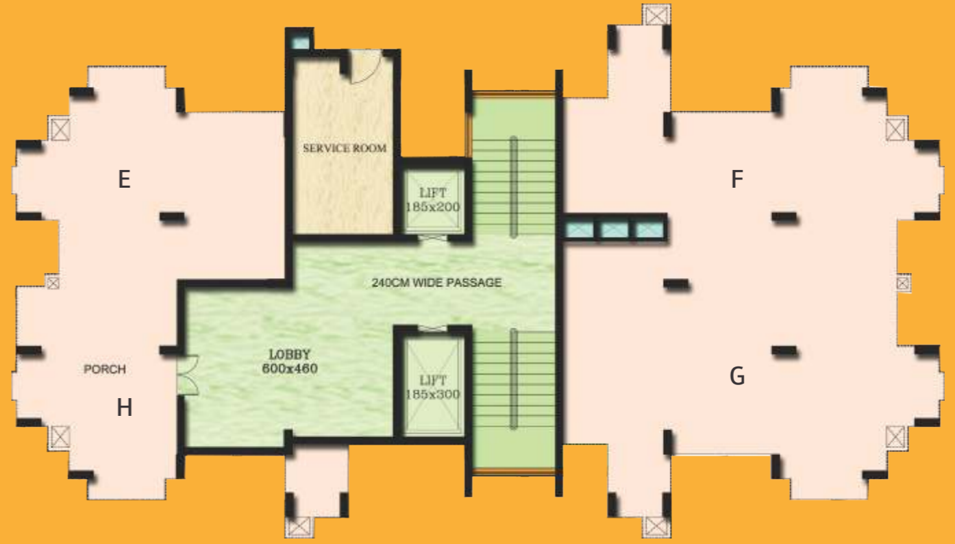
Block: 2 | 2BHK | Ground floor plan