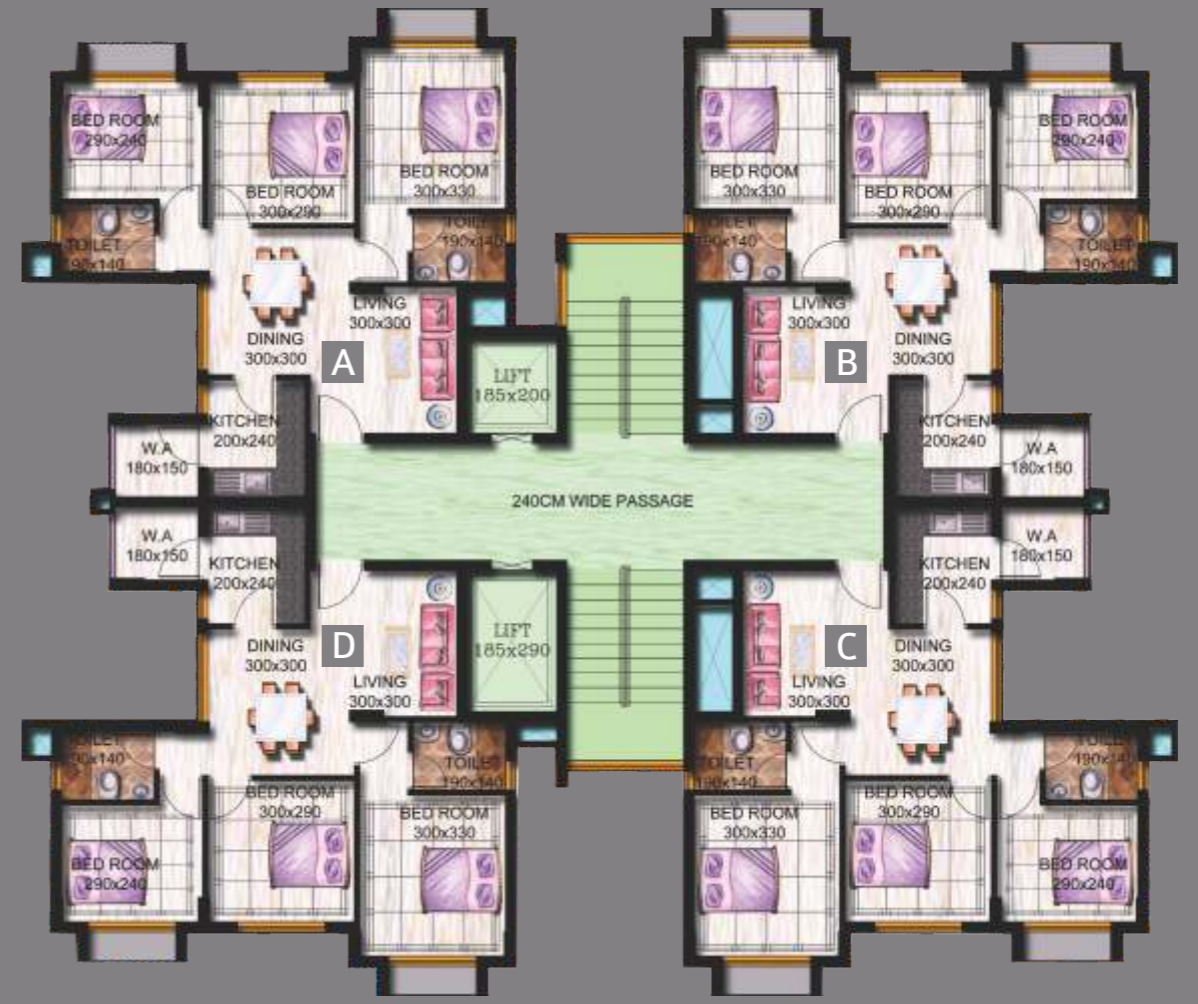
Block: 1 | 3BHK | Typical floor plan