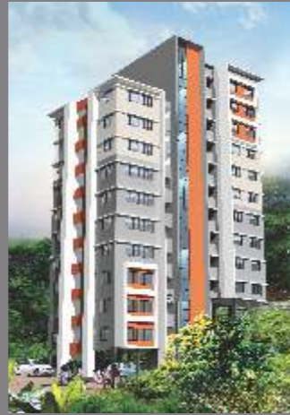
Aqua bay, Premium Apartments, Kuttippuram