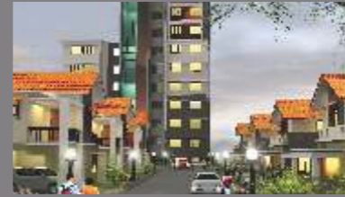
Serene, Premium Villas, Kuttippuram