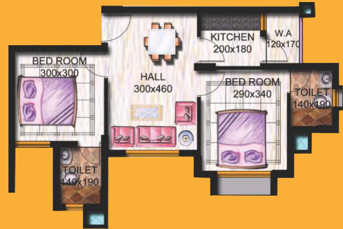
Type: G | 2BHK | Super built up area: 755 sq.ft.