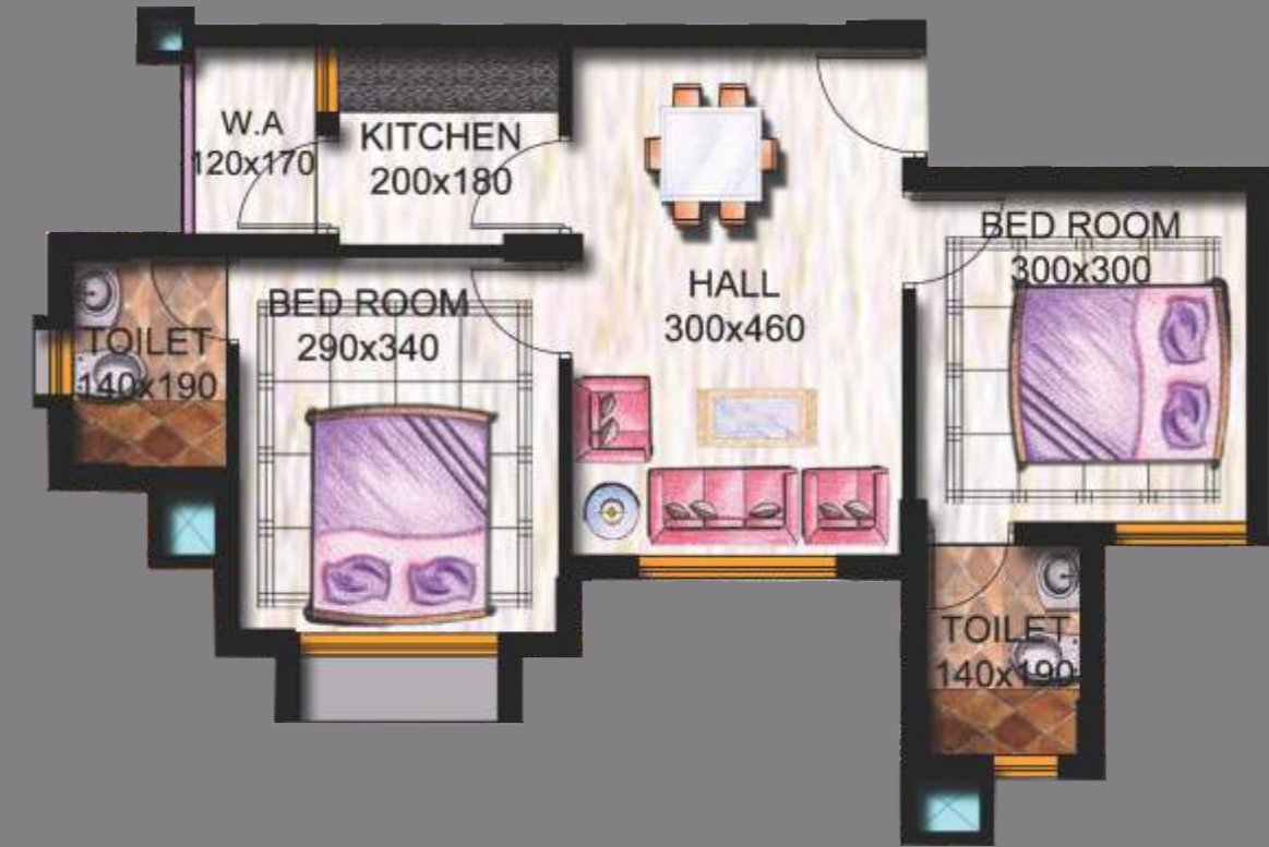
Type: H | 2BHK | Super built up area: 755 sq.ft.