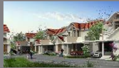
Peach Tree, Premium Villas, Tirur